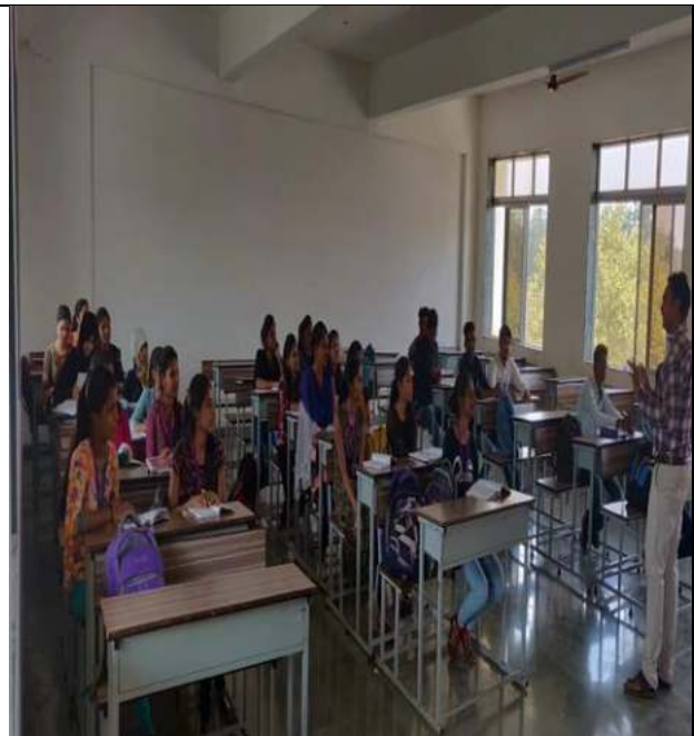
Class Room 215