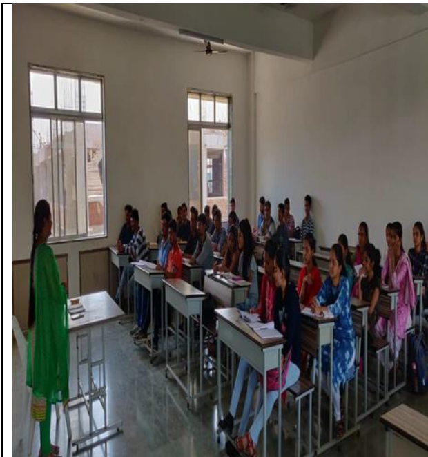
Class Room 216

02527-272399 | Mob: 9594962018 | ssjcop3241@gmail.com