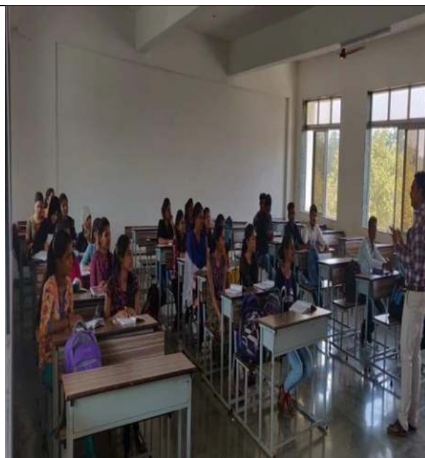
Class Room 215