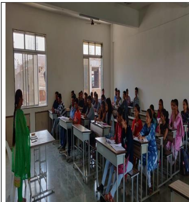
Class Room 216