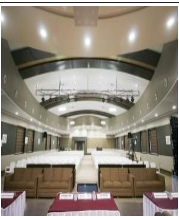
Fig. Auditorium Hall